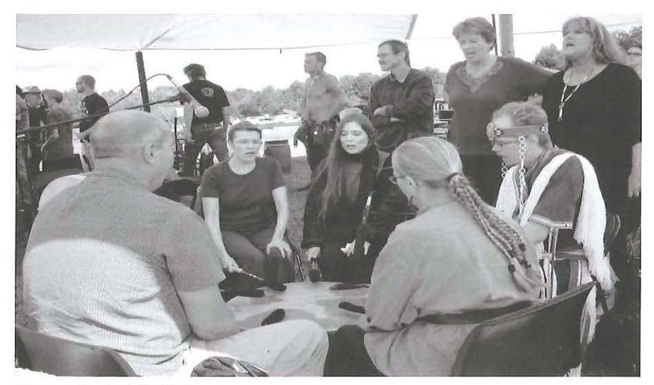
Figure 2. Red Calf Singers

her had a relatively decent skill level, but overall the Scandinavian dancers, who were primarily clothed in Northern Plains "Traditional" regalia, did not seem to have that much of a physical connection with how American Indian dancers move. And while some dancers had nicely crafted outfits with high quality beadwork, many had hybrid designs with what seemed to be Scandinavian motifs. One Swedish dancer explained to me that her inspiration had been a combination of American Indian design combined with "Viking" elements of her own heritage, and several participants told me, with pride, that while the Vikings had "visited" North America, they had not stayed and colonized. This mythic tale of a Viking-Indian connection and friendship has also been mentioned to me by several Lakota Indians in the United States, who say that when the Vikings came to North America they did not conquer and colonize, and because of this some (Plains) Indians tend to hold Scandinavians in higher regard than they do other Europeans.