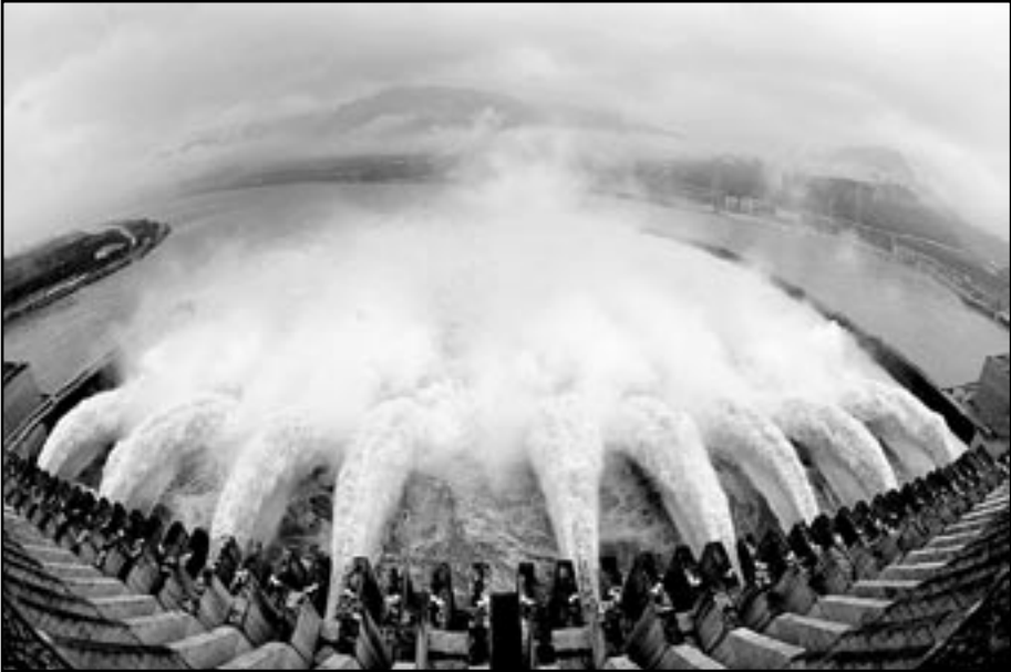
FIGURE 4. Three Gorges Dam Discharging Water