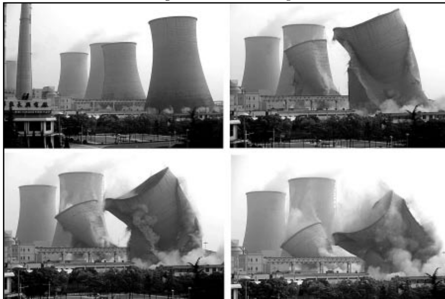
FIGURE 3. Series of Photos Showing the Cooling Towers of Two 125-MW Units at Huaneng's Changxing Power Plant in Zhejiang Province being Demolished in September 2010