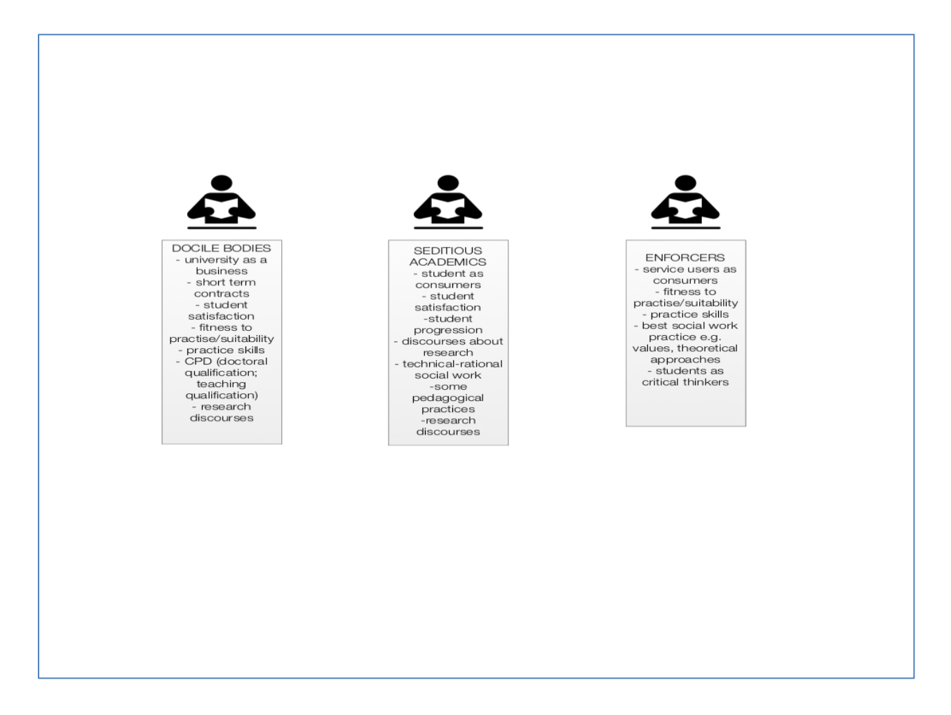
Figure 2: Positions of social work academics in relation to competing normalising judgements

in response to neoliberal notions of students as consumers of social work education, enforcing norms of service users as consumers of social work education. These positions provided a means to negotiate complex neoliberal influences in higher education whilst retaining social work professional integrity.