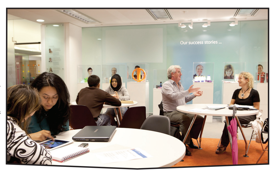
British Library Business & IP Centre

There are activities currently underway which we hope will help us to address these.