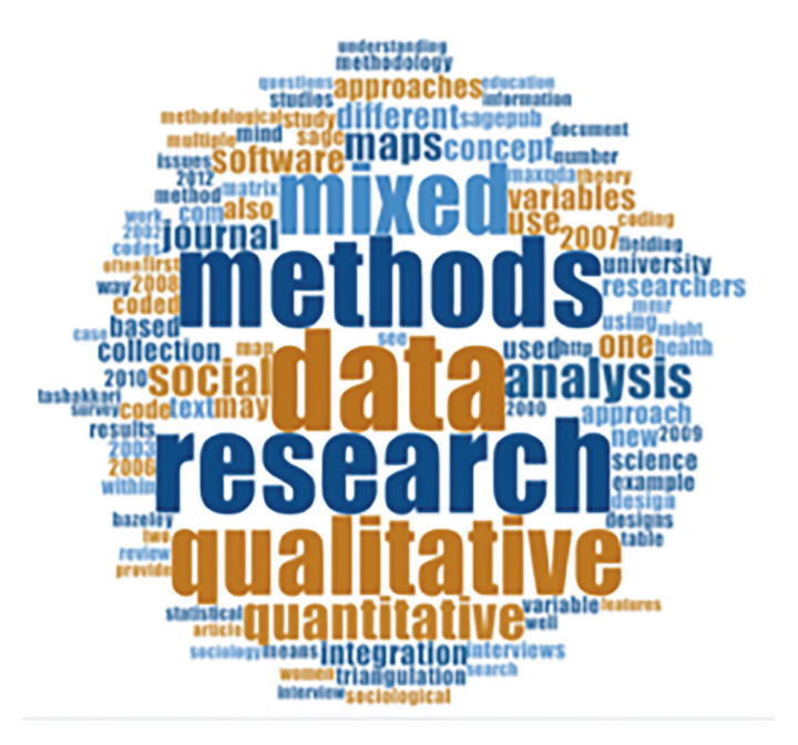
Fig. 1. Word cloud of literature discussing mixed methods research in the social sciences (NVivo)

Working directly with literature has many uses but it can be fruitful to initially work indirectly. This involves creating writing spaces within CAQDAS that represent literature and writing appraisals that are then analysed, for example, searching and coding to synthesize and compare. A structured template reflecting the review's focus ensures appraisals are